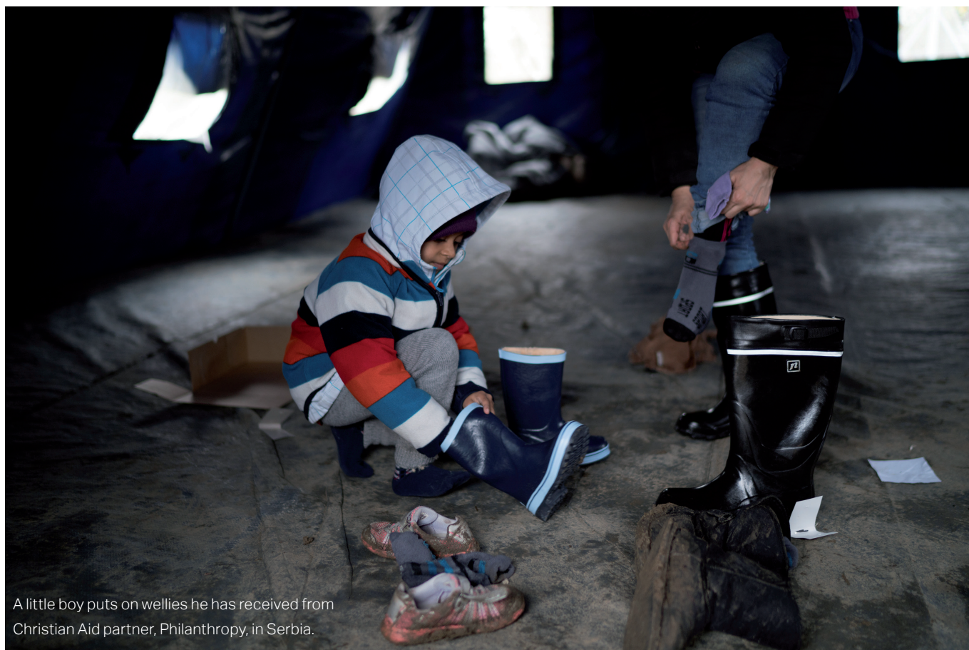
A little boy puts on wellies he has received from Christian Aid partner, Philanthropy, in Serbia.

The use of images has been instrumental in highlighting the migration of people into Europe, evoking a variety of responses. For example, the heart rending image of little Alan Kurdi's body being picked up from a Turkish beach on 2 September 2015 1 , the widely criticised poster of those migrating used as part of the Brexit campaign 2 and the poignant image of a life raft suspended from the rafters of a church in London with three life jackets, two adult sized and one child, on the threshold of Christmas. 3 These images have the power to humanise, to 'other' and to theologise. It is the intention of this paper, which sets out to be a 'theological reflection on migration', to reflect on the image of God present in every person who migrates. This divine image-bearing often gets lost in the vast statistics and party politics that surround this very natural phenomenon.